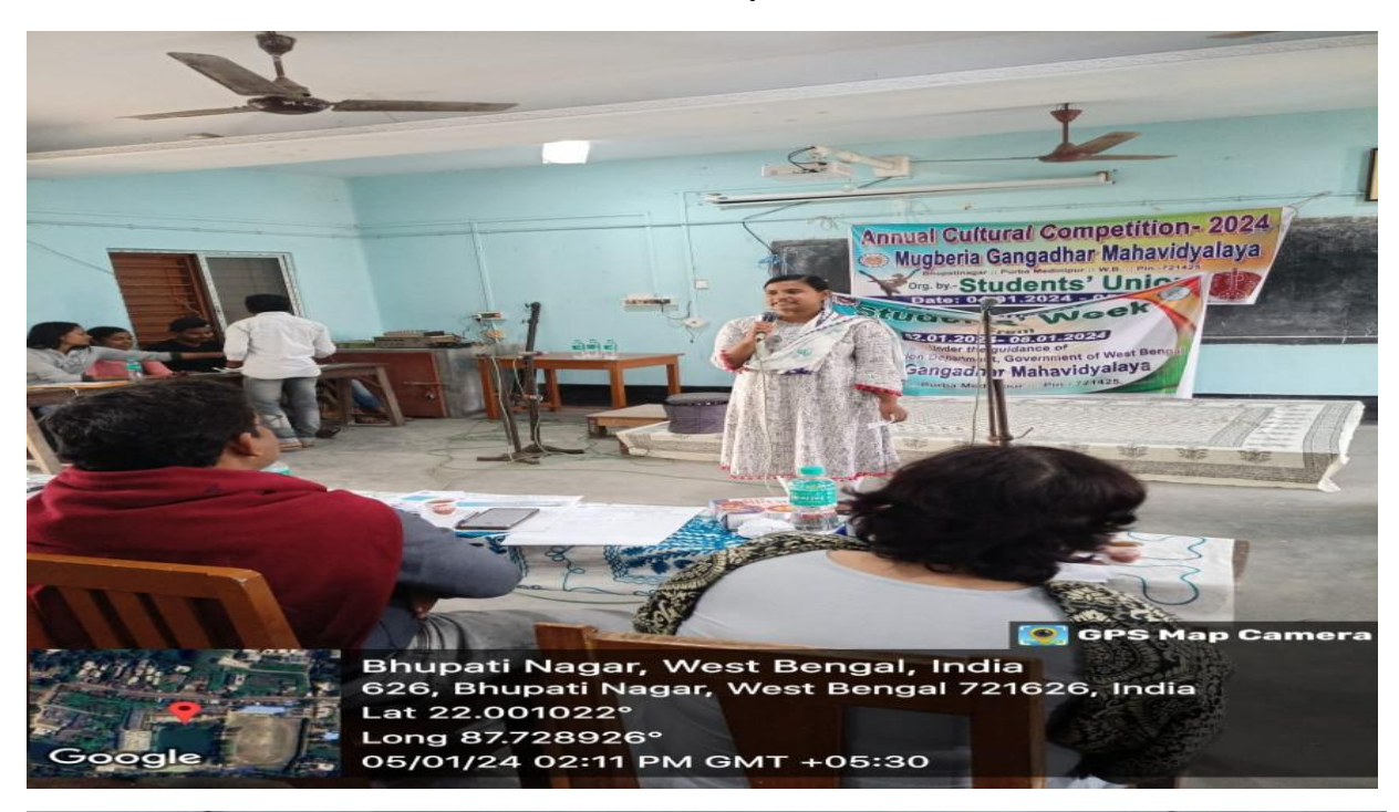
Day-3 Cultural Competition