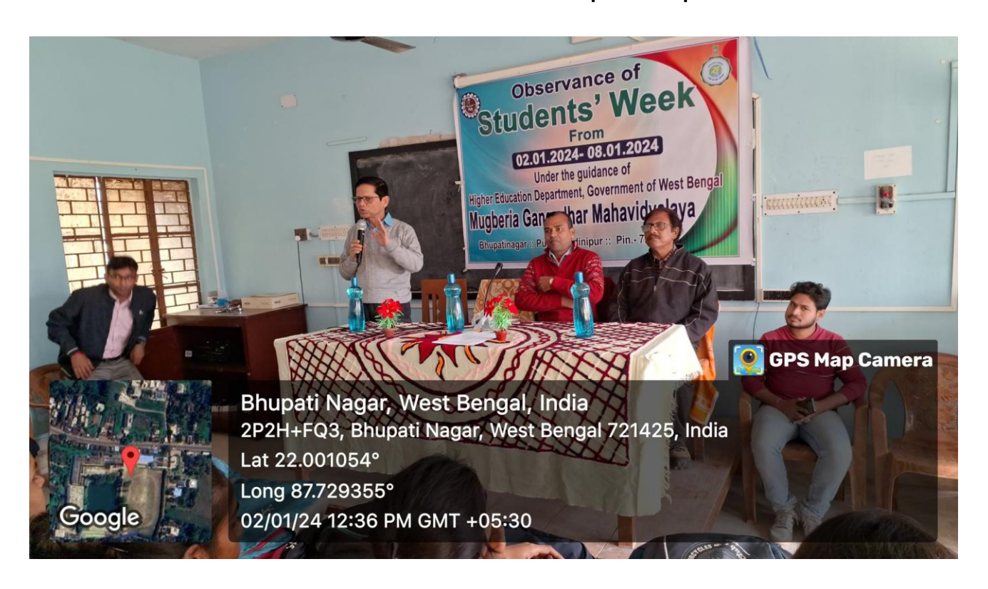
Day-1 Students Credit Card Awareness CampCum Help Desk